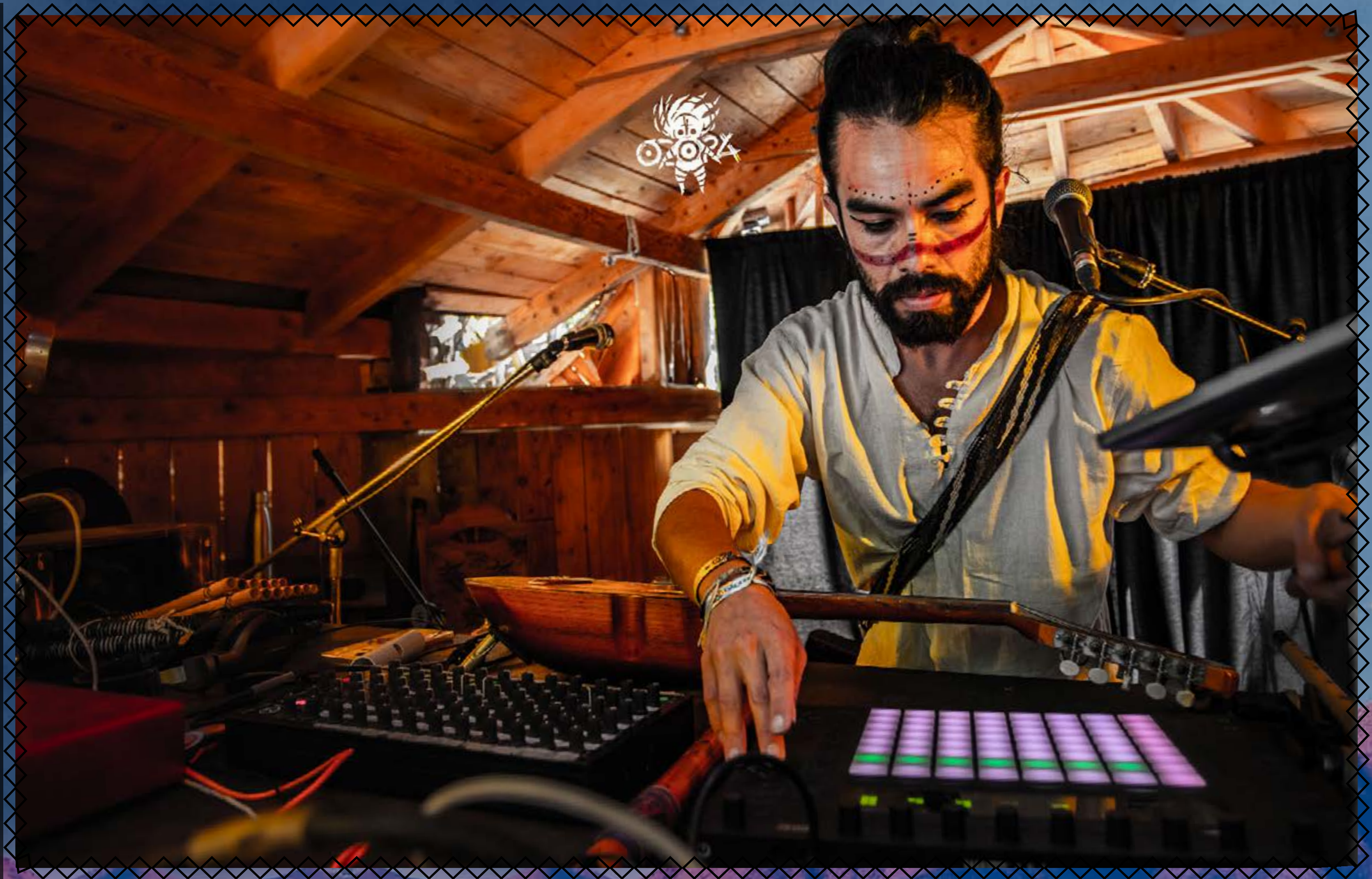
Ozora Festival, Ozora, Hungary. (2023)

Each concert is a different experience, it includes Andean wind instruments (queenas, pinguyos, sicus) as well as electronic controllers and depending on the conditions of the place can also include: Marimba de Chonta, guitar, charango , Galician bagpipes .